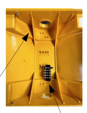
Shown with 5 position term. block