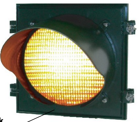
Available colors: Yellow, Black, Dark Green