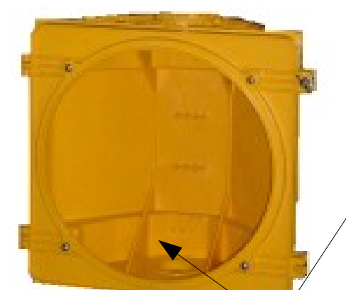
Added strength with reinforcing fins at top & bottom